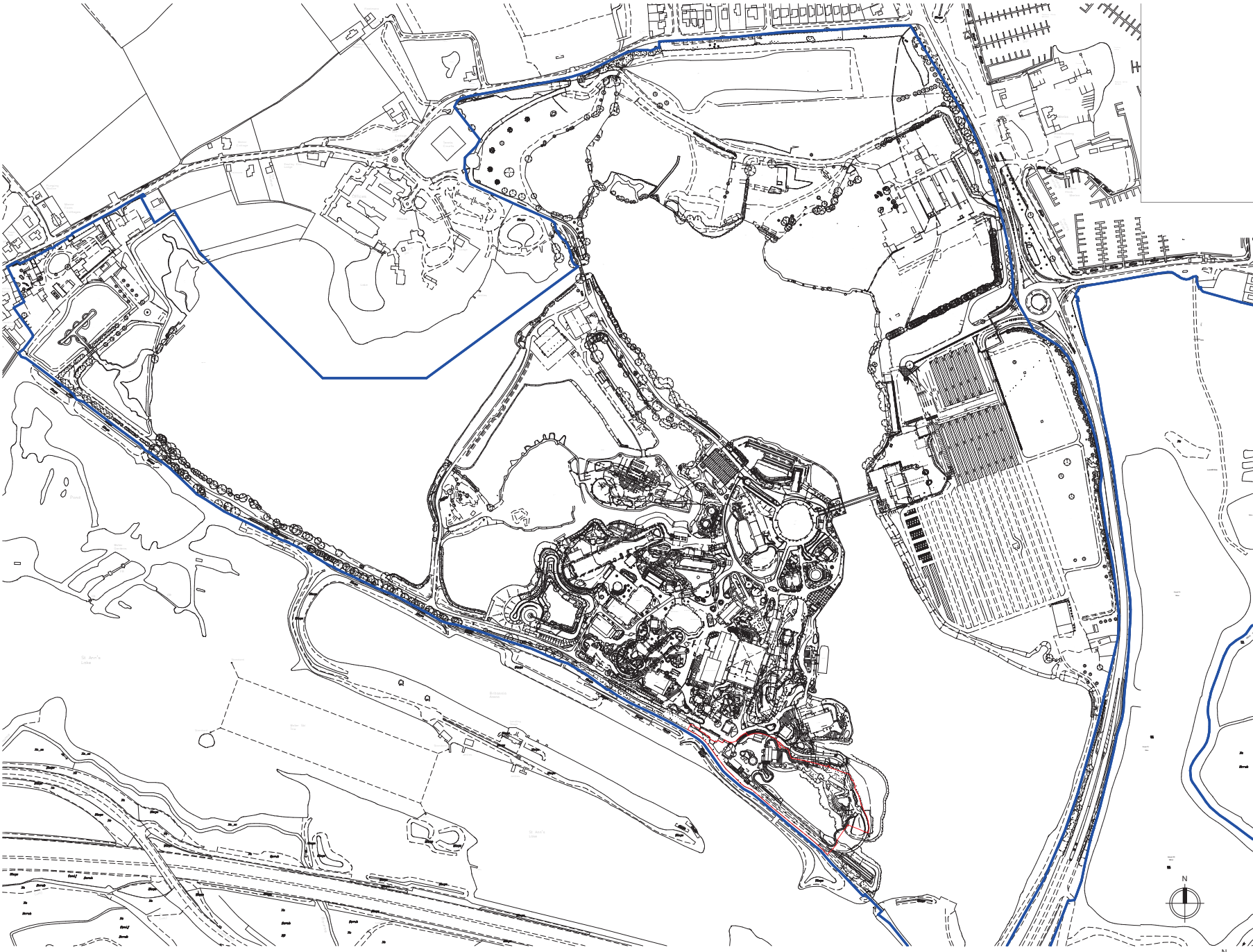
1 Location Plan SCALE 1 : 2500

BM 380177024 Datum:TP24-SA-XX-XX-MD-A-0001 rd